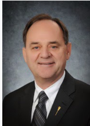
Honorable Minister Herb Cox

Cox's portfolio includes responsibility for water and water security issues, as well as dealing with the wildfire situation currently affecting the province.